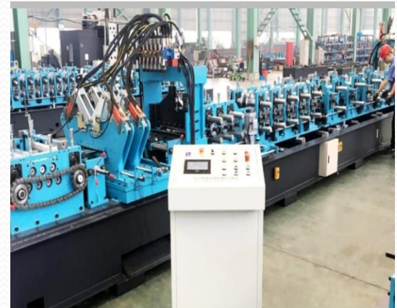
c & z roll forming machine