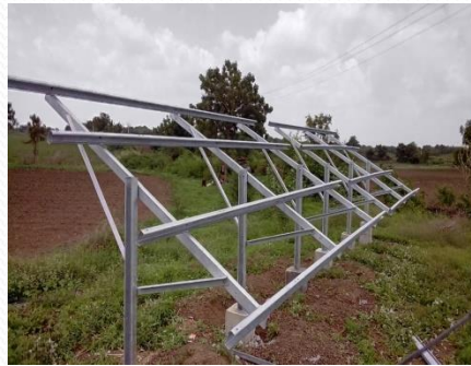
Fix type structure