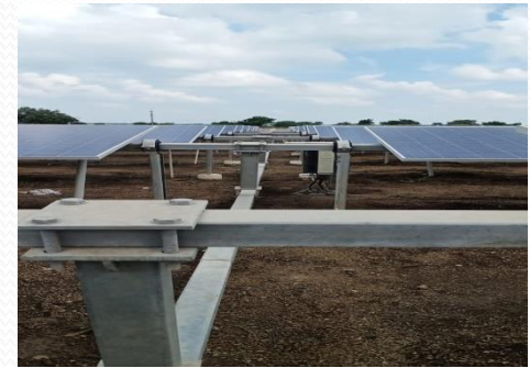
Auto tracking structure